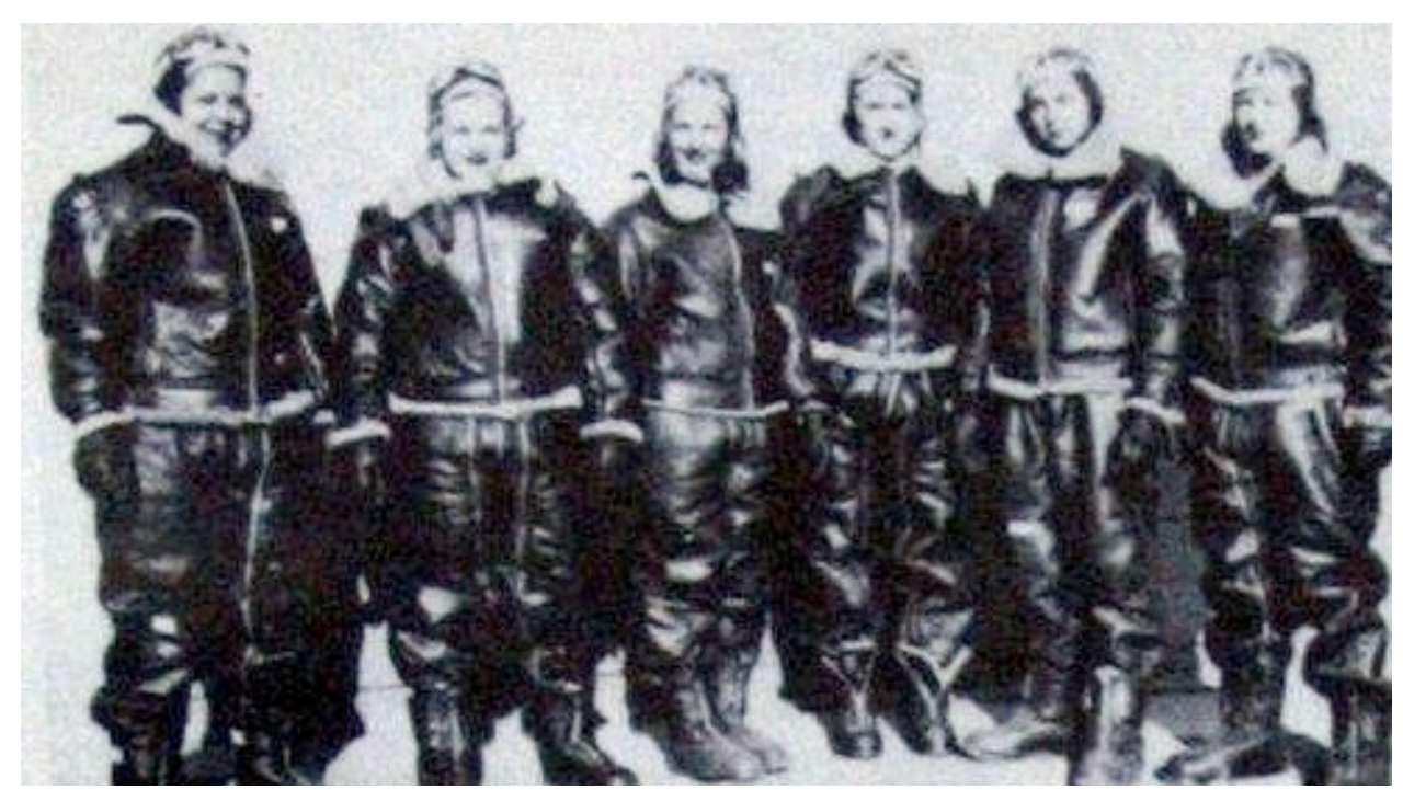
318 AAFFTD Class members, Avenger Field, Sweetwater, TX. ca. 1943.