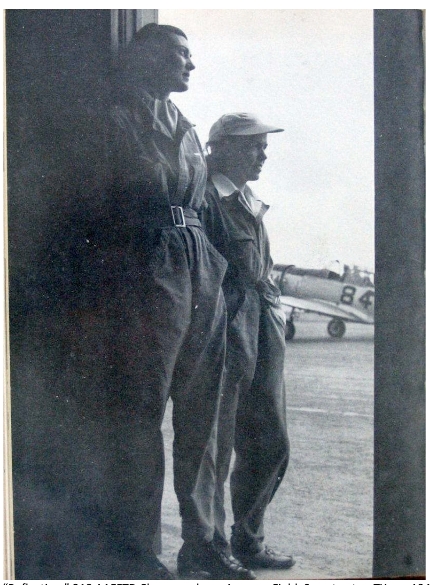
"Reflecting." 318 AAFFTD Class members, Avenger Field, Sweetwater, TX. ca. 1943. (USAAF)